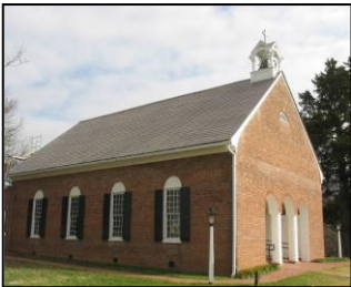
From St. John's Episcopal Warsaw, Virginia 1981