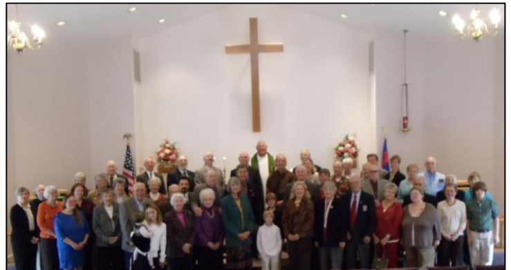
30th Anniversary Congregation 4DEC2011