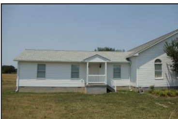
Classrooms Addition 2012