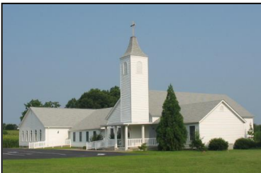
After Fellowship Hall Addition 2005